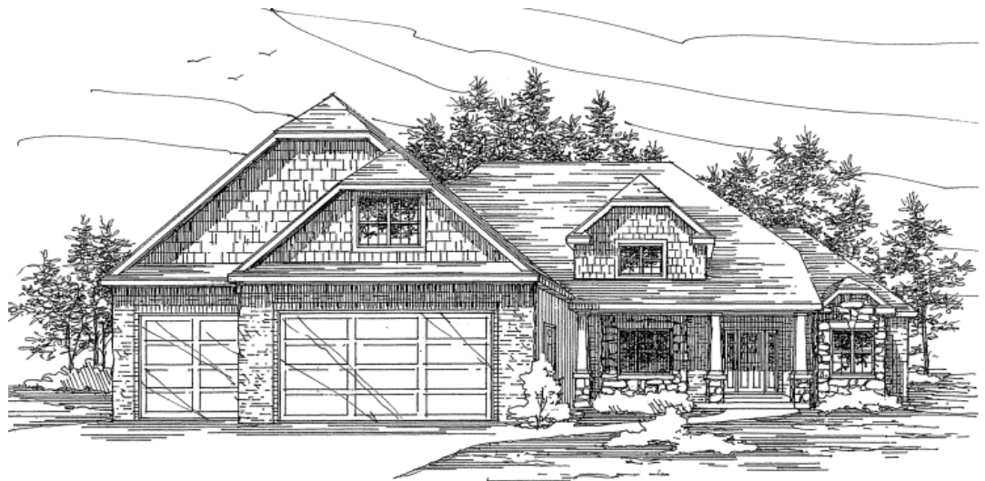
Copyright © Jon Huss Custom Homes Inc.

Style: 2-story Total Square Footage: 2,845 1st: 1,615 2nd: 887 Bonus: 343 Bedrooms: 4 Bathrooms: 2.5 Decorated and furnished For Sale